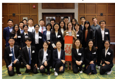
Visiting the University of Chicago