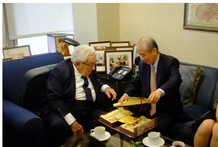
Meeting with Henry Alfred Kissinger