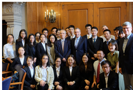
Meeting with the president of Harvard University